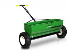
1. Drop Spreader