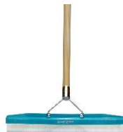
2. Grandi Groom