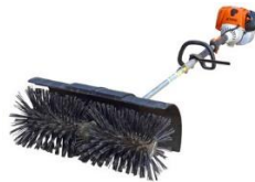
5. Power Broom