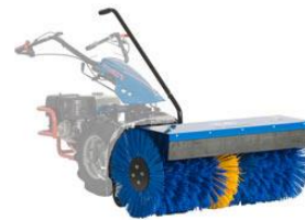
6. BCS Walk Behind (Larger installs)